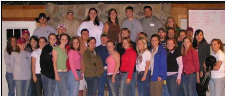
2005 B&B Club Members At The Pit

The 2004-05 academic year proved to be another busy one for the eighty members of the UGA Block and Bridle Club. The Club continues to meet at "The Pit" for social events and conducts a number of service projects in the greater Northeast Georgia community.